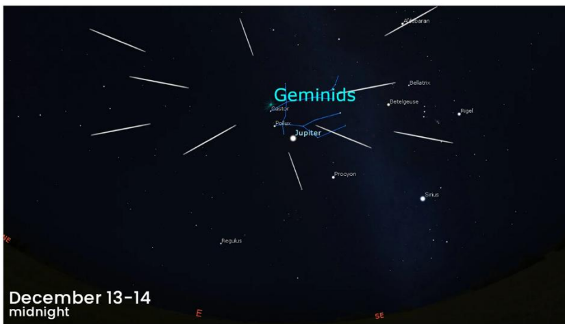
The radiant of the Geminid meteor shower, in the southeastern sky, on the night of December 13-14, 2025.

However, it's this weekend, especially on Friday and Saturday nights, that the universe is expected to deliver an amazing show, as the annual Geminid meteor shower reaches its peak.